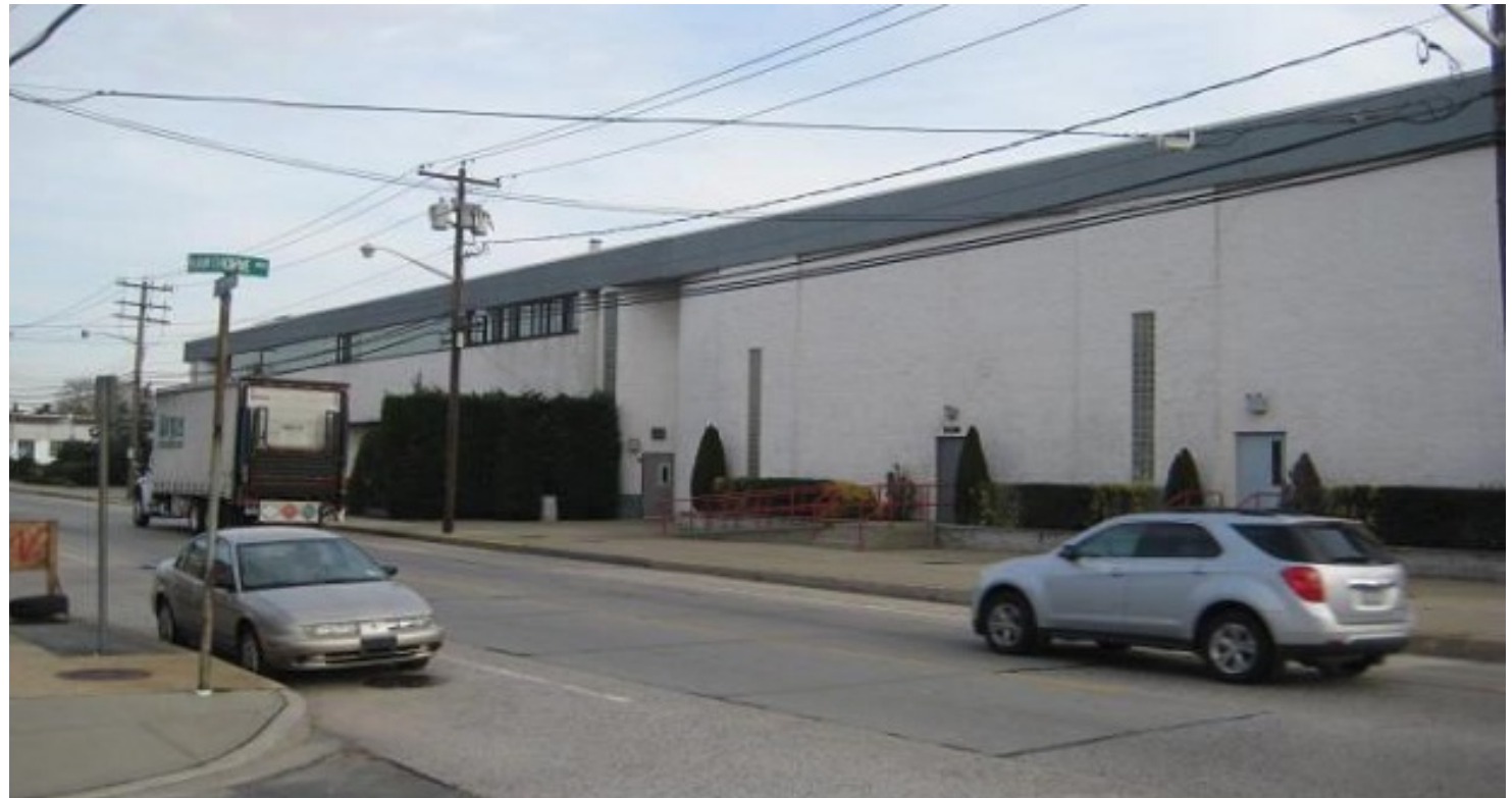
2525 Long Beach Road, Oceanside